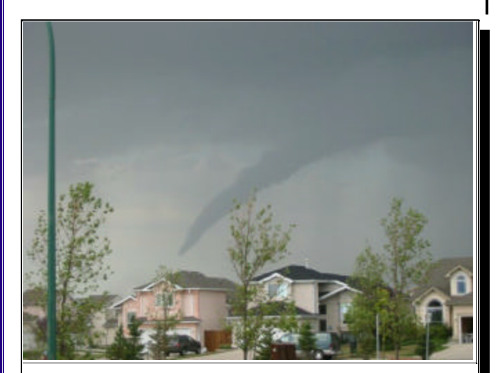
photo taken by Luke VE4WTF approx 1640h August 20,2006 looking north from our house in Amber Trails. Luke attended CANWARN Spotter Training APR06 in Beausejour

For example, digital projectors capable of showing Power Point presentations, DVD's or teaching programs directly from the Internet are built into most classrooms. Another benefit is the exposure of our students to the variety of programs available at RRC. A win-win for RRC and us.