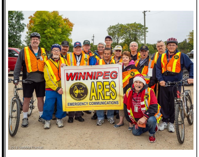
Winnipeg ARES volunteers for 2018 Parkinson SuperWalk

VE4s BOY, GWN, MMG, VD, JAH, RCA, CDM, MWH, GKS, DJS, VID, KAZ, JFK, HK VA4s VMM, RWT.