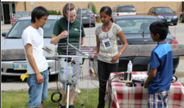
Working the Satellites