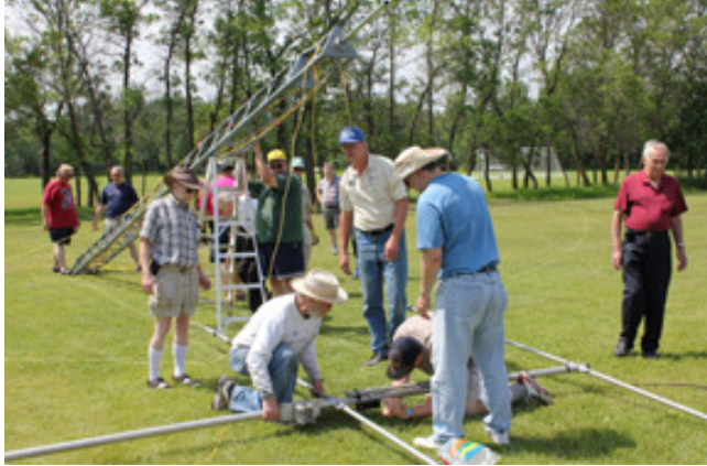
Like clockwork, well, sort of, the large crew was on hand to erect the HF beam. By 1300 hours local time VE4BB was on the air!