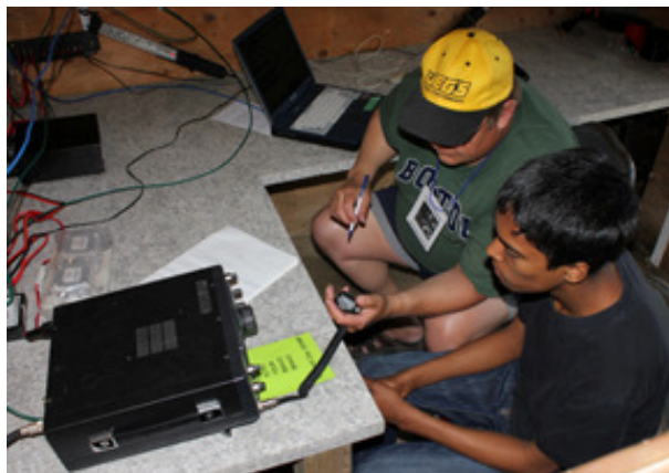
And well into the contest on HF!