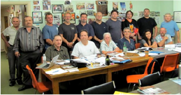
Basic 5 Class Sep 27, 2011

His Chapter Quizzes have been used in classes across Canada. Thank you, Sandy.