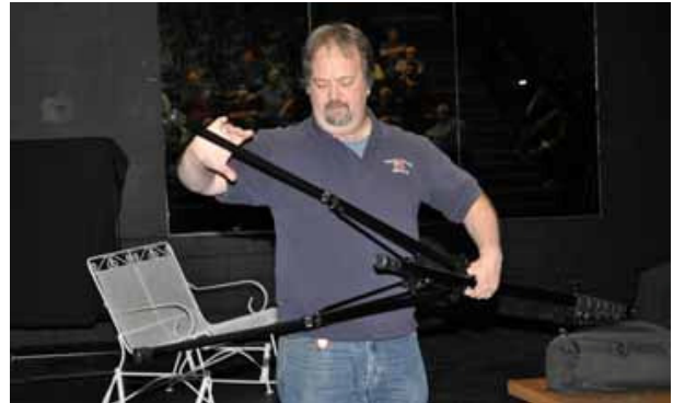
Assembling the Buddipole