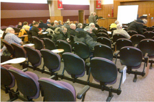
2013 Spotter Training Session in Citizenship Courtroom Union Station

We picked up 15 new Spotters, 6 from outside Winnipeg.