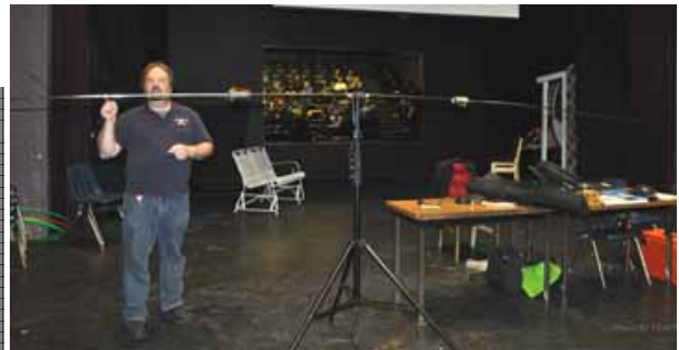
Ready for transmitting!