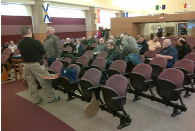
VE4s BOZ & MBQ conversing just before training session begins