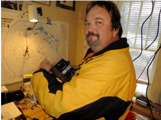
It's ready for hoisting to its final height!!!

7 Once the antenna is tuned and analyzed