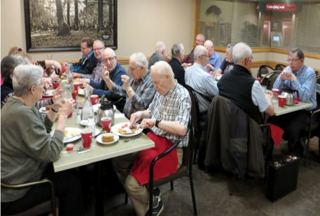
Seniors monthly breakfast before AGM

WSCRC held its AGM on November 13 at the Canad Inn on McPhillips following their monthly breakfast.