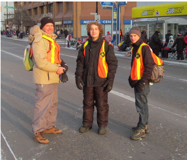
Some of our SHARP Volunteers

Manitoba Repeater Society Pathfinder's ARC Manitoba Emergency Communications Shaftsbury High Altitude Robotics Project Winnipeg Amateur Radio Club.