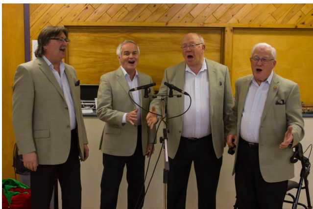
"Vocal Point" Barber Shop Quartet