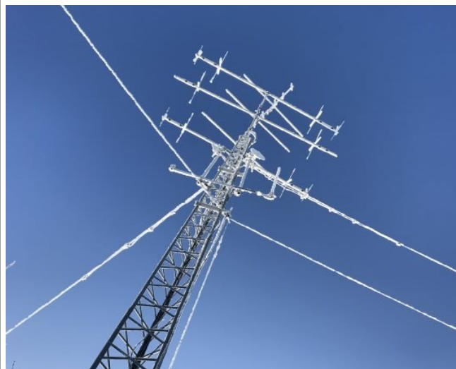
Looking up the tower, Alpha Delta 40-80 NVIS wire antenna, Alpha Delta 6-80 DX-CC wire antenna, 1.2 GHZ vertical, 5.8GHZ microwave data links, 2,3GHz vertical (data), Cushcraft MA5B mini beam for 10-12-15-17-20, Cushcraft A627013S beam 6m (horizontal), 2m/70cm (vertical). On a DMX medium 60' tower

ly go up the tower and shake and brush it off the antennas, and the third is, well... More power. Now where did I put that kilowatt amplifier and my registration for RAC's advanced amateur radio operator certificate course. I need to be prepared for next winter.