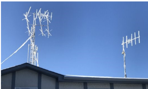
The picture(s) show the build-up of this frost/icing on all the antenna and wires of every amateur radio station in the area.

I'm not sure if it is the global warming, that has been in the news for the last few years, but if you live in Winnipeg during the winter where global warming can not come soon enough, this year has been very interesting. With a deep freeze and almost a month of severe cold warnings from Environment Canada, the arrive of the Christmas season, brought much warmer temperature, with lows of -15 and highs of around -8. For Winnipeg is actually quite balmy. Warm enough that we don't need our command start for the vehicles nor do we need to plug them in. Jackets are seen not zipped up as people go from car to home or store. While all this seems very nice, the real beauty of the warmer spell we are experiencing is the fog in the mornings and the Hoar frost and Rime icing that clings to everything. This is especially true for anything metal.