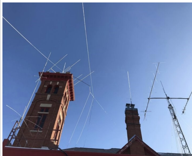
Other photo shows part of the antenna farm at the Winnipeg Senior Citizens Radio Club located in an old fire-hall in south Winnipeg. Consisting of and End-Fed wire 10-80, G5RV, Tri-band 10-15-20 Beam, R7 Multiband Vertical, Carolina Windom in the attic, Long wire in the hose tower and a couple of Magnetic Loops indoors (for easy tuning), Ringo Ranger VHF Vertical, Comet VHF/UHF Vertical, VHF & UHF dual polarity 11 Element Satellite array, a couple of VHF Copper J-poles, 24GHz datalink, 5.8GHz data link, 3.2 GHz data link and a 2.3Ghz data link.